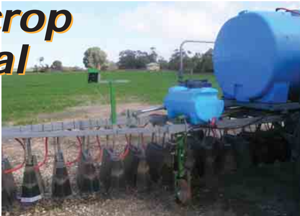
Frustrated by the cost of in crop weed control, Peter Farrow designed his own high precision, shielded spray-rig. Ryegrass counts were 57 plants/m 2 for an sprayed inter rows (R) compared to only 1.5 plants/m 2 when sprayed with a non-selective herbicide.

With support from Malcolm and KEE Technologies, Peter has designed a 12m (40ft) shielded sprayer consisting of 41 shrouds, each 23cm (9") wide. Each plastic shroud contains one spray nozzle and is attached to the bar with a parallelogram mounting. The spray tank is 2500 litres and the whole rig is mounted on the three point linkage.